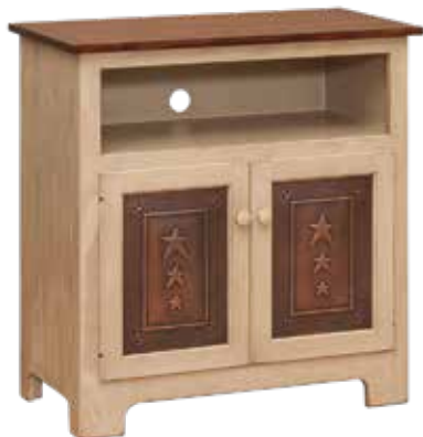
S89T Two Door TV Cabinet 31.125"w x 16"d x 32.5"h Harvest Top Beige with Rub Base Also available with Raised Panel Doors S89W