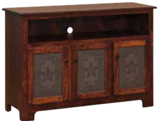
S89AT Three Door 46" TV Cabinet with Tin 46.375"w x 16"d x 32.5"h HD Michael's Cherry Also available with Raised Panel Doors S89AW