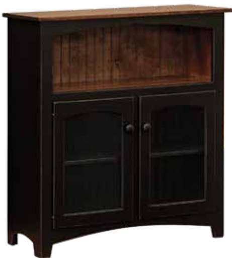
4042 Bookcase 40"w x 13"d x 42"h One fixed shelf behind doors Special Walnut Top Black with Rub Bead Board Back