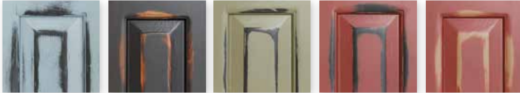
LC 19 Amsterdam