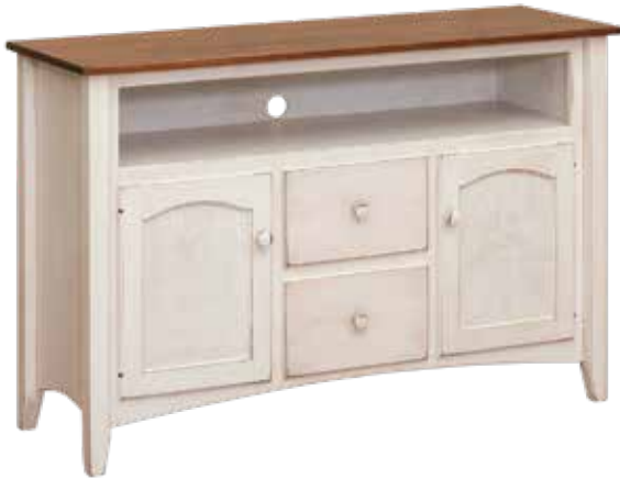
C55W 50" TV Cabinet (A) with Two Drawer Flat Panel 50"w x 17"d x 33.5"h Michael's Cherry Top Coco White with Rub Base