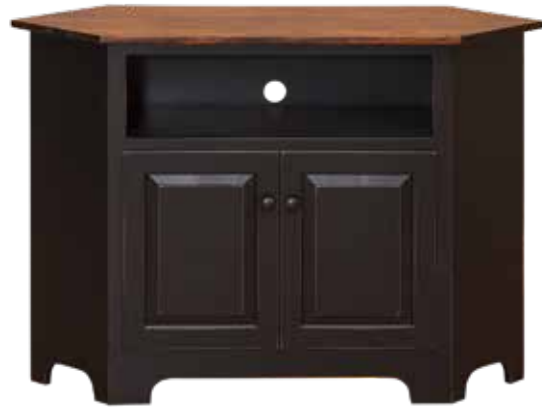
S92W Two Door Corner TV Cabinet with Raised Panels, 16" Deep