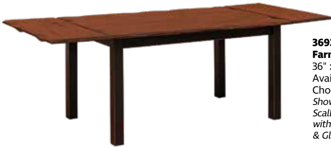
3692M Farmhouse Table 36" x 60" x 92" Available in 5 Sizes Choose from 3 Leg Styles Shown in Heavy Distress with Scalloped Edges, Michael's Cherry Top with Glaze, Black with Rub-Thru & Glaze Base