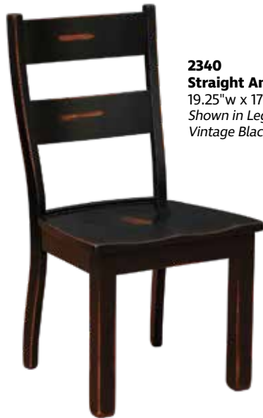
2340 Straight Amhurst 19.25" w x 17.25" d x 38" h Shown in Legacy Vintage Black