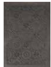
Old Mill in Blackened Tin