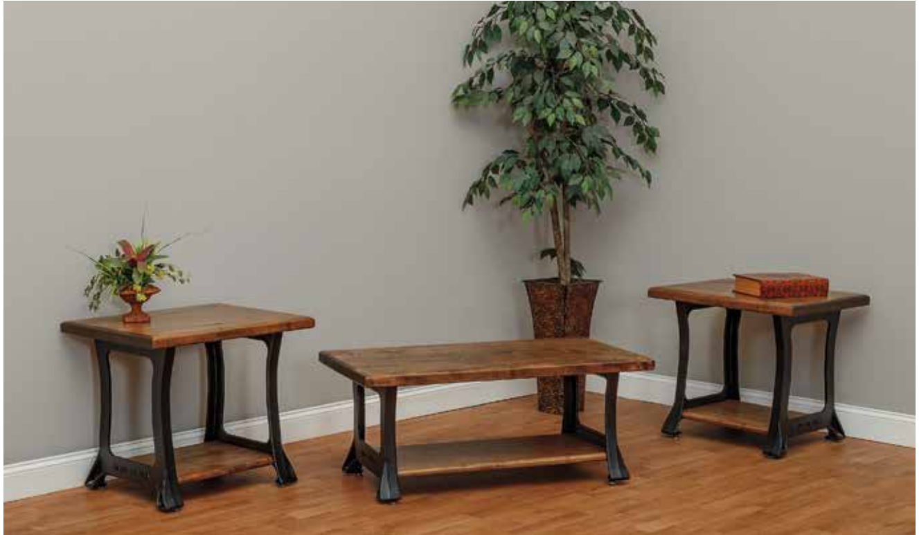
Cast Iron Base Coffee & End Tables