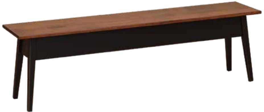
B37 60" Shaker Bench with Wormy Maple Top Michael's Cherry Top Black with Rub-Thru Glaze 60" w x 12.75" d x 18" h Available in 4', 5' and 6'