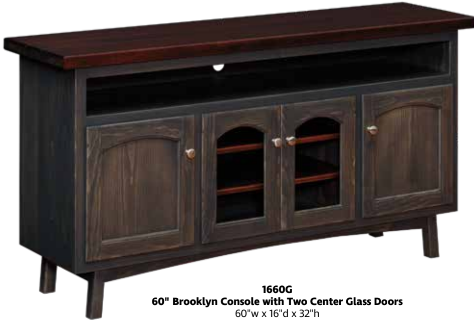
1660G 60" Brooklyn Console with Two Center Glass Doors 60"w x 16"d x 32"h Shown in Rustic Brown Maple, Sawmill Plank Top, OCS-117 Asbury Top, OCS-118 Antique Slate Pine Base Also Available with Flush-Cut Top 1656G