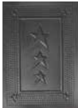
Embossed Star in Country Tin