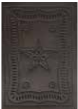
Federal in Blackened Tin