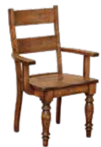
2341T Turned Amhurst 24.5" w x 17.25" d x 38" h