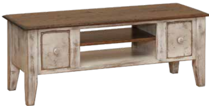
T110 Coffee Table 48" w x 18" d x 19" h With Two Drawers Wormy Maple Top HD Special Walnut Top HD LC Coco White Base