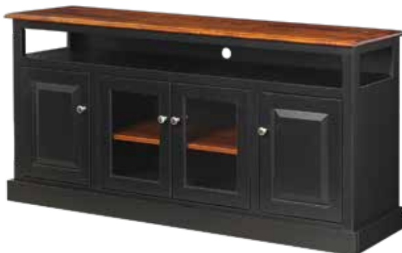
6230 62" Open End TV Console 62"w x 16"d x 30"h Shown in Michael's Cherry Top, Two Shelves, Base True Black Also available in 70" (7030)