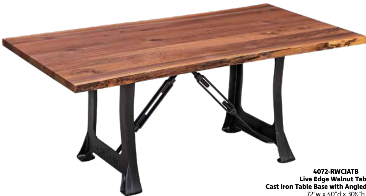
4072-RWCIATB Live Edge Walnut Table Cast Iron Table Base with Angled Turnbuckles 72"w x 40"d x 30½"h Shown in Rustic Walnut