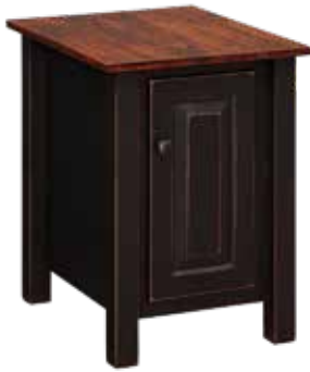
T103 End Table with Wormy Maple Top 18" w x 22" d x 25" h Michael's Cherry Top Black with Rub Base