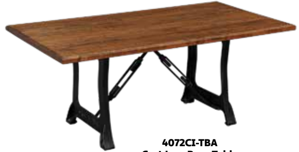
4072CI-TBA Cast Iron Base Table with Angled Turnbuckles, Wormy Maple Top 72"w x 40"d x 30"h Shown in Heavy Distress Special Walnut Top