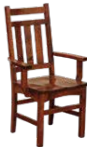
222 Montreal 24.5"w x 17"d x 41"h