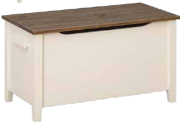
1836 Shaker Poplar Chest 36" w x 18" d x 21" h Special Walnut Top Base Coco White with Rub