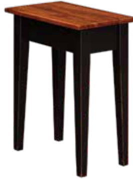
T98 Shaker Chair Side 12" w x 20" d x 25" h Wormy Maple Top Michael's Cherry Top Black with Rub Base