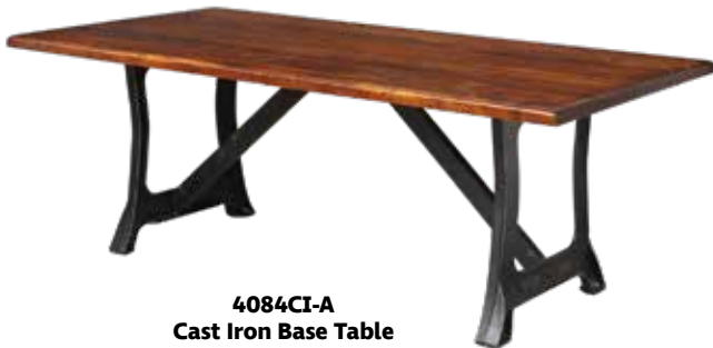
4084CI-A Cast Iron Base Table with Angled Stretchers, Wormy Maple Top 84"w x 40"d x 30"h Shown in Heavy Distress Michael's Cherry Top