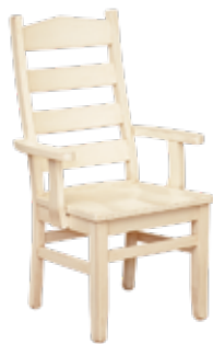
193 Stockholm 23.5" w x 18.75" d x 41.25" h