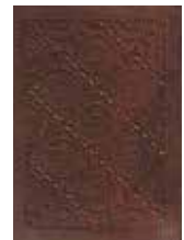
Old Mill in Rustic Tin