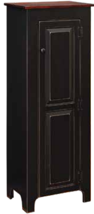
2157 One Door Jelly Cupboard 21"w x 14"d x 57"h Three Fixed Shelves Michael's Cherry Top Black Rub-Thru Base