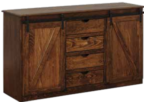
6236BD Barn Door Sideboard with Four Drawers 62"w x 18"d x 36"h Shown in Heavy Distress Special Walnut