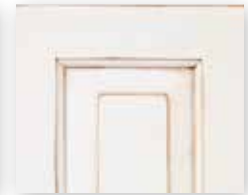
#9 Coco White