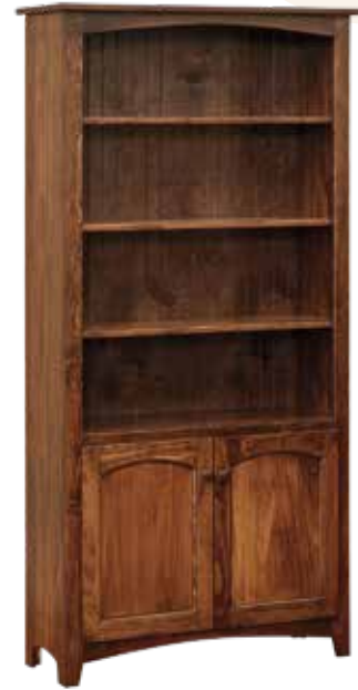
367213D 36"w x 13"d x 72"h One adjustable shelf behind door Special Walnut Bead board Back Also available in 5 ft — 366013D