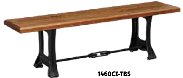
1460CI-TBS Iron Base Bench with Straight Turnbuckle, Wormy Maple Top 72"w x 14"d x 18"h Base Bench with Turnbuckle Straight Shown in Heavy Distress Special Walnut Top