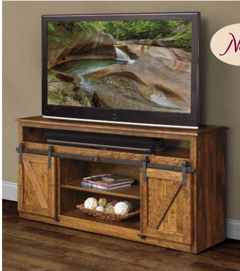
7030BD2 70" Barn Door TV Console with Sound Bar Opening 70"w x 16"d x 30"h Shown in Heavy Distress, Special Walnut