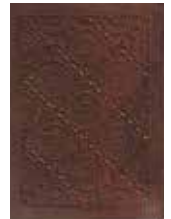
Old Mill in Rustic Tin