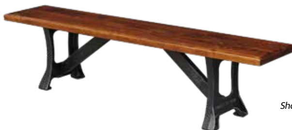
1472CI-A Cast Iron Base Bench with Angled Stretchers, Wormy Maple Top 72"w x 14"d x 18"h Shown in Heavy Distress Michael's Cherry Top