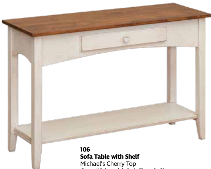
106 Sofa Table with Shelf Michael's Cherry Top Coco White with Rub-Thru & Glaze 45"w x 16"d x 30"h