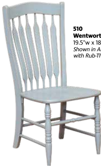
510 Wentworth 19.5"w x 18"d x 41.25"h Shown in Amsterdam with Rub-Thru & Glaze