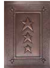
Embossed Star in Copper