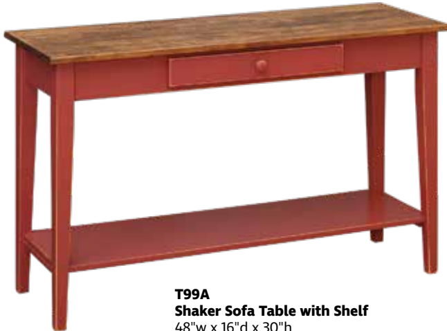
T99A Shaker Sofa Table with Shelf 48"w x 16"d x 30"h Wormy Maple Top Special Walnut Top Cottage Red with Rub Base