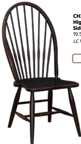
CH34 High Back Windsor Side Chair 19.5"w x 24"d x 41.5"h LC Vintage Black