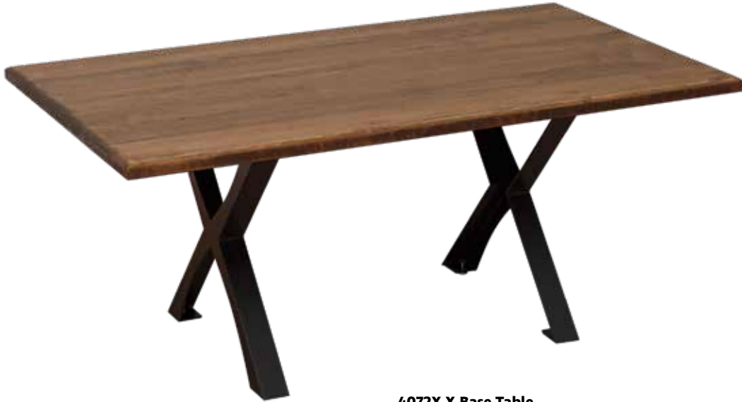
4072X X-Base Table 1¾" Wormy Maple Top