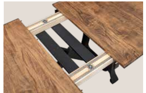
Heavy-duty Pedestal Table Slide Opens to fit two additional 12" self-storing leaves