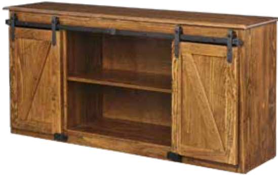
6230BD1 62" Barn Door TV Console with Tall Doors 62"w x 16"d x 30"h Shown in Heavy Distress, Special Walnut