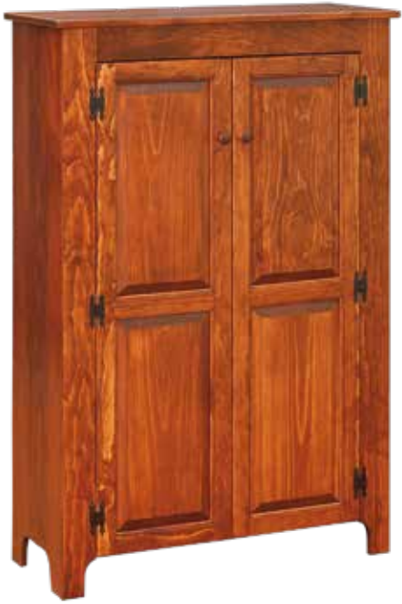
3757 Two Door Jelly Cupboard 37"w x 14"d x 57"h Harvest