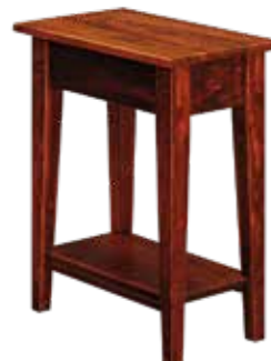
T98A Shaker Chair Side with Shelf 12"w x 20"d x 25"h Wormy Maple Top Michael's Cherry