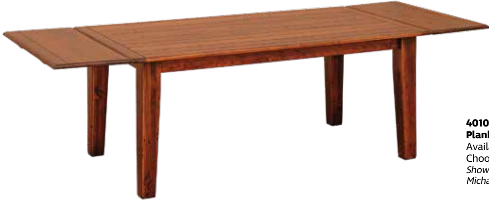
40104-S Plank Top Table Available in 5 Sizes Choose from 3 Leg Styles Shown in Heavy Distress Michael's Cherry with Glaze