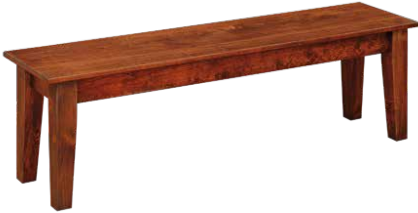
1457-S Farmhouse Bench 57" w x 14" d x 17.5" h Available in 5 sizes Choose from 3 leg styles Shown in Michael's Cherry