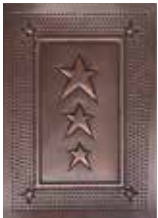
Embossed Star in Copper