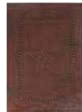
Federal in Rustic Tin