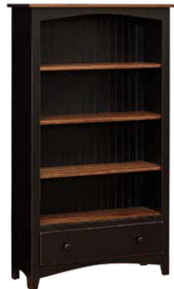
3560 Bookcase with Drawer 35"w x 13"d x 60"h Three adjustable Shelves Special Walnut Top Black with Rub Bead Board Back