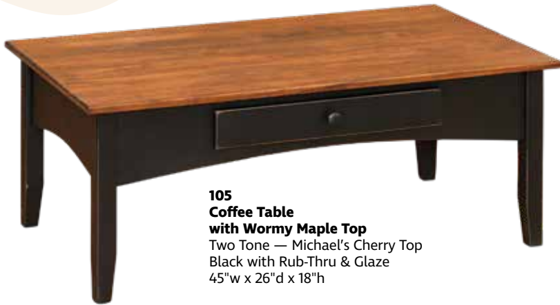
105 Coffee Table with Wormy Maple Top Two Tone — Michael's Cherry Top Black with Rub-Thru & Glaze 45"w x 26"d x 18"h