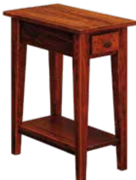
T98DA Shaker Chair Side with Shelf and Drawer 12"w x 20"d x 25"h Wormy Maple Top Michael's Cherry