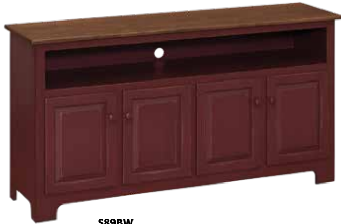
S89BW Four Door TV Cabinet with Raised Panel 60.5"w x 16"d x 32.5"h Two Tone — Special Walnut Top Barn Red with Rub Base Also available with Tin Doors S89BT