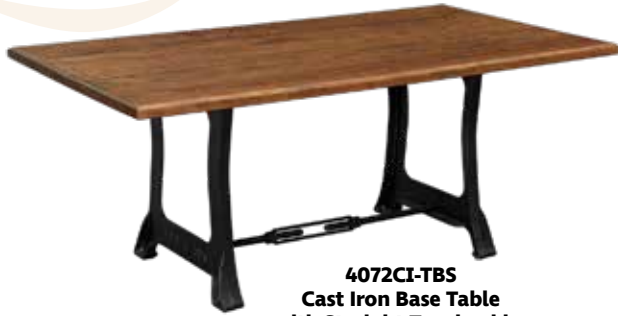
4072CI-TBS Cast Iron Base Table with Straight Turnbuckle, Wormy Maple Top 72"w x 40"d x 30"h Shown in Heavy Distress Special Walnut Top