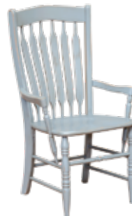
512 Wentworth 24"w x 18"d x 41.25"h