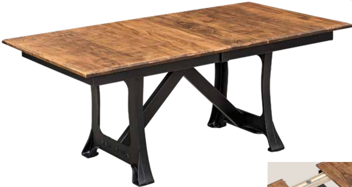
4072-CIPET Pedestal Extension Table with Two 12" Leaves with Cast Iron Table Base 72"w x 40"d x 30½"h (closed) Shown in Wormy Maple Top