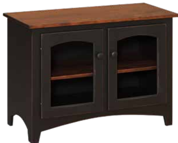
C56 34" TV Console 34"w x 16"d x 24.75"h Two Doors Two Tone — Michael's Cherry Top Black with Rub Base