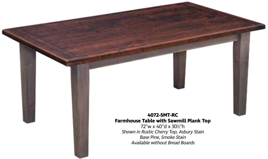
4072-SMT-RC Farmhouse Table with Sawmill Plank Top 72" w x 40" d x 30½" h Shown in Rustic Cherry Top, Asbury Stain Base Pine, Smoke Stain Available without Bread Boards