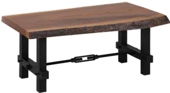
4324LE Coffee Table Post & Beam 43"w x 24"d x 18"h Rustic Walnut Top, Poplar Base Shown in Clear Coat Top Base True Black