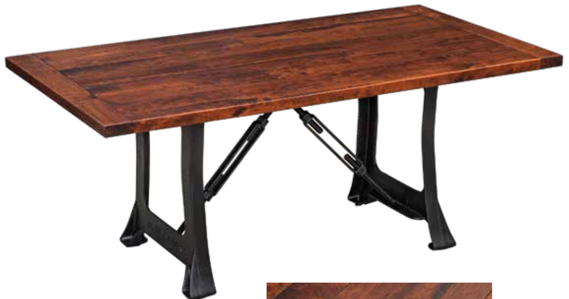
4072-BFCIATB-RC Farmhouse Table with Barn Floor Boards Plank Top, Cast Iron Base with Turnbuckle 72" w x 40" d x 30½" h Shown in Rustic Cherry with Michael's Cherry Stain Available without Bread Boards