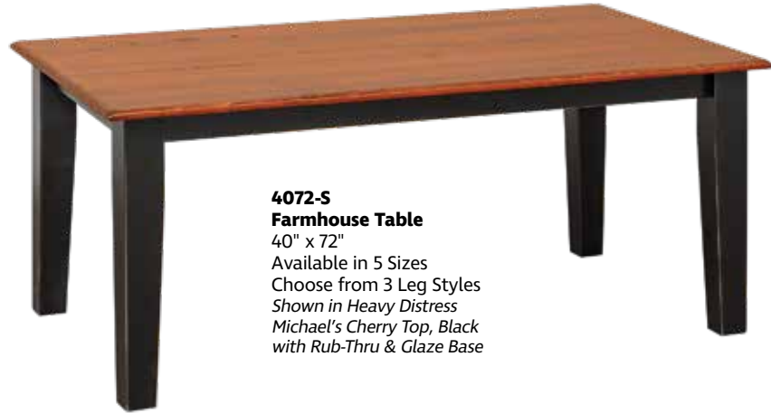
4072-S Farmhouse Table 40" x 72" Available in 5 Sizes Choose from 3 Leg Styles Shown in Heavy Distress Michael's Cherry Top, Black with Rub-Thru & Glaze Base