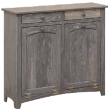
C50 Double Recycling Cabinet 40.5"w x 13"d x 36.5"h Slate