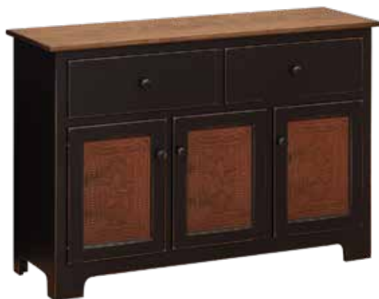
B35T Three Door Cabinet with Tins 46.375"w x 16"d x 32.5"h Special Walnut Top Black with Rub Base

Also Available with Flat Panel Doors C54W