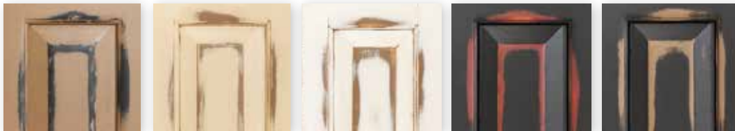
LC 10 Brown