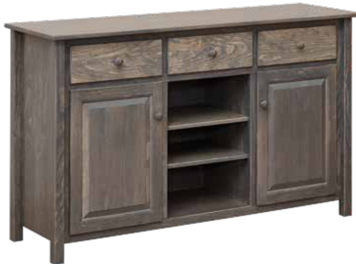
6036 Sideboard 60"w x 18"d x 36"h Fixed Shelf Behind Doors Adjustable Shelves in Center Shown in Slate Stain Wormy Maple Top