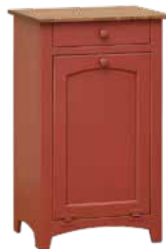
C51 Recycling Cabinet 22.5"w x 13"d x 36.5"h Special Walnut Top Cottage Red with Rub Base