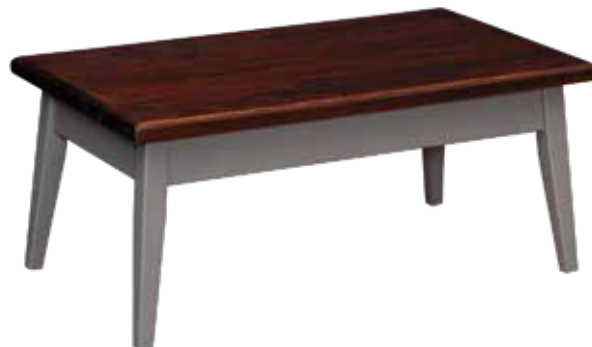
2242 Brooklyn Coffee Table 42"w x 24"d x 18½"h Shown in Rustic Brown Maple, Sawmill Plank Top, OSC-117 Asbury Top, OCS 348 Chelsea Gray Base