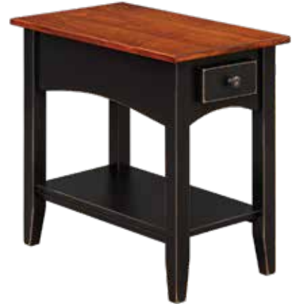
103 Chairside Table Two-tone — Michael's Cherry Top Black with Rub-Thru & Glaze 14"w x 26"d x 24"h