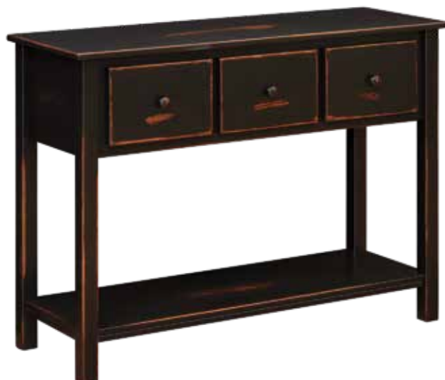
5036 Sideboard 50"w x 18"d x 36"h Shown in Legacy Vintage Black Wormy Maple Top