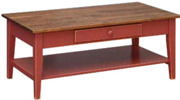
T100A Shaker Coffee Table with Shelf 42"w x 24"d x 18"h Wormy Maple Top Special Walnut Top Cottage Red with Rub Base