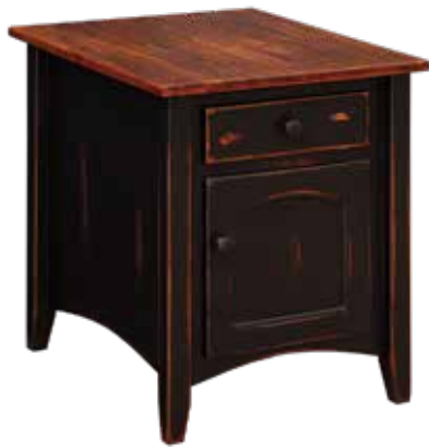
T107A End Table with Drawer and Door 21" w x 26" d x 25" h Wormy Maple Top Michael's Cherry Top LC Vintage Black Base