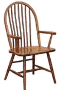
1741 Denver 23.25"w x 16.25"d x 39"h