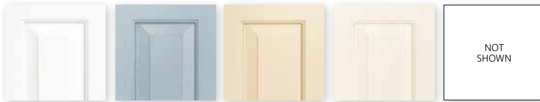
300 True White