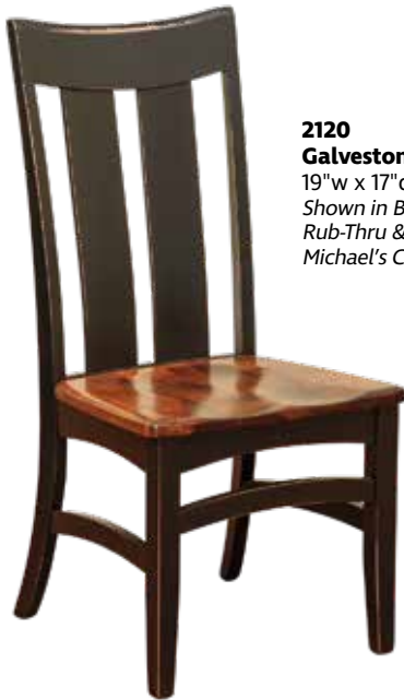
2120 Galveston 19" w x 17" d x 40.25" h Shown in Black with Rub-Thru & Glaze, Michael's Cherry Seat