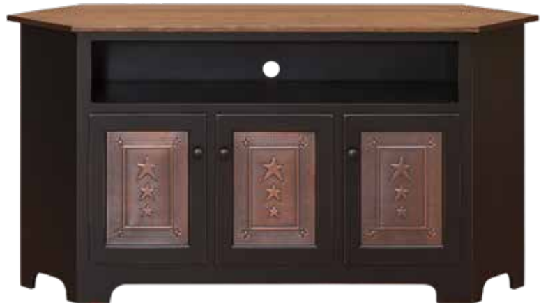
S93T Three Door Corner TV Cabinet with Tin, 16" Deep