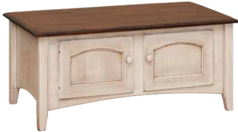
T109 Coffee Table with Doors 41" w x 22" d x 18.5" h Wormy Maple Top HD Michael's Cherry Top Coco White with Rub Base