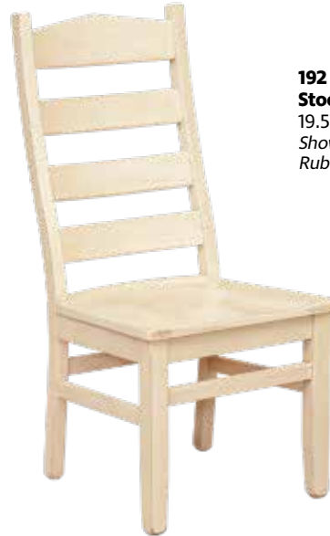
192 Stockholm 19.5" h x 18.75" d x 41.25" h Shown in Sandstone with Rub-Thru and Glaze