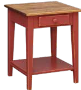
T101A Shaker End Table with Shelf 20"w x 20"d x 25"h Wormy Maple Top Special Walnut Top Cottage Red with Rub Base