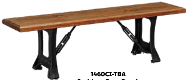
1460CI-TBA Cast Iron Base Bench with Angled Turnbuckles, Wormy Maple Top 72"w x 14"d x 18"h Shown in Heavy Distress Special Walnut Top