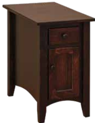
T108A Chair Side Table With Door & Drawer 15" w x 26" d x 25" h Wormy Maple Top OCS Onyx