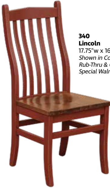
340 Lincoln 17.75"w x 16.5"d x 39.75"h Shown in Cottage Red with Rub-Thru & Glaze Special Walnut Seat