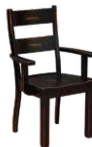
2341 Straight Amhurst 24.5" w x 17.25" d x 38" h