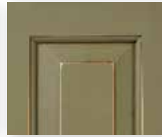
#12 Antique Green