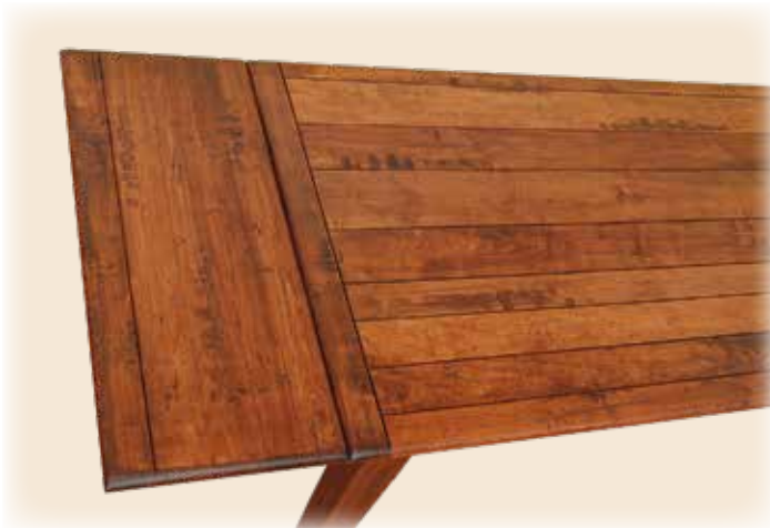
Showing company board option for any table