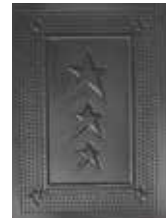
Embossed Star in Country Tin