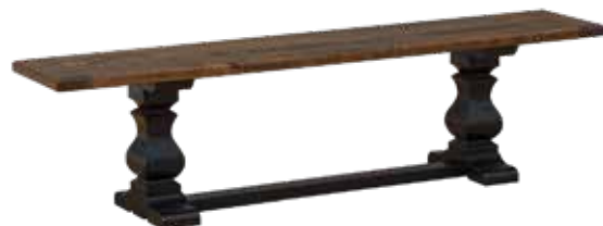
1472T-BFT-RC Trestle Bench 14"w x 72"L x 18"h Sawmill Plank Top Shown in Rustic Cherry Top, Light Distress Special Walnut Stain Base: Pine, True Black Available without Bread Boards