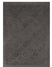
Old Mill in Blackened Tin