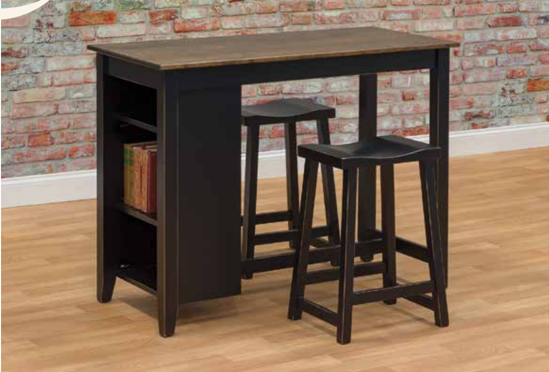
2248 Bar Table Wormy Maple Top, Pine Base 48"w x 22"d x 36"h Wormy Maple Top Shown in special Walnut Top Black with Rub Base