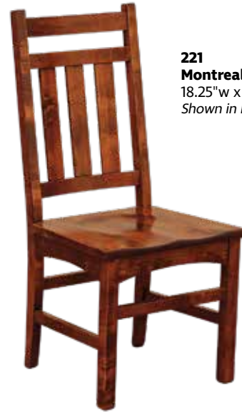
221 Montreal 18.25"w x 17"d x 41"h Shown in Michael's Cherry