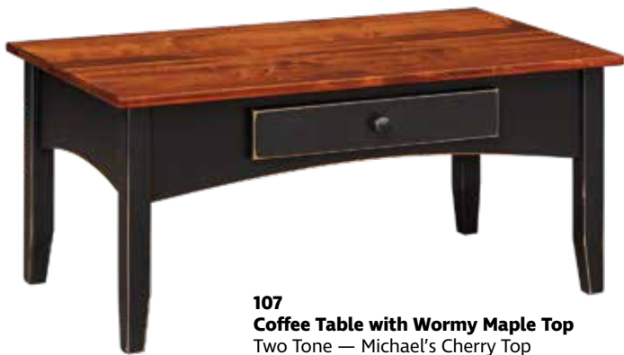
107 Coffee Table with Wormy Maple Top Two Tone — Michael's Cherry Top Black with Rub-Thru & Glaze 38"w x 22"d x 19"h