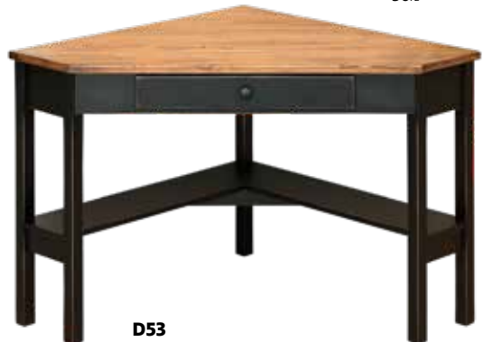
D53 Corner Desk with Wormy Maple Top Two Tone — Special Walnut Top Black with Rub Base