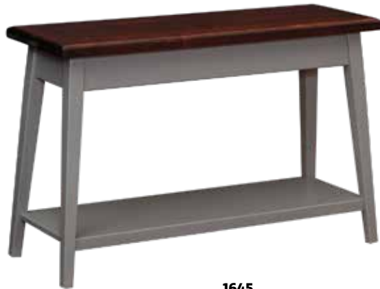
1645 Brooklyn Sofa Table with Shelf 45"w x 16"d x 29½"h Shown in Rustic Brown Maple, Sawmill Plank Top, OSC-117 Asbury Top, OCS 348 Chelsea Gray Base