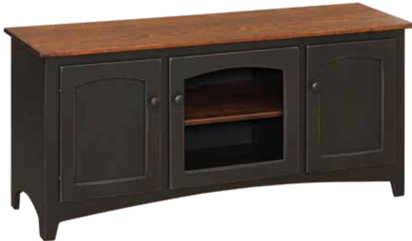
C57 53" TV Console 53"w x 16"d x 24.75"h Three Doors Two Tone — Michael's Cherry Top Black with Rub Base