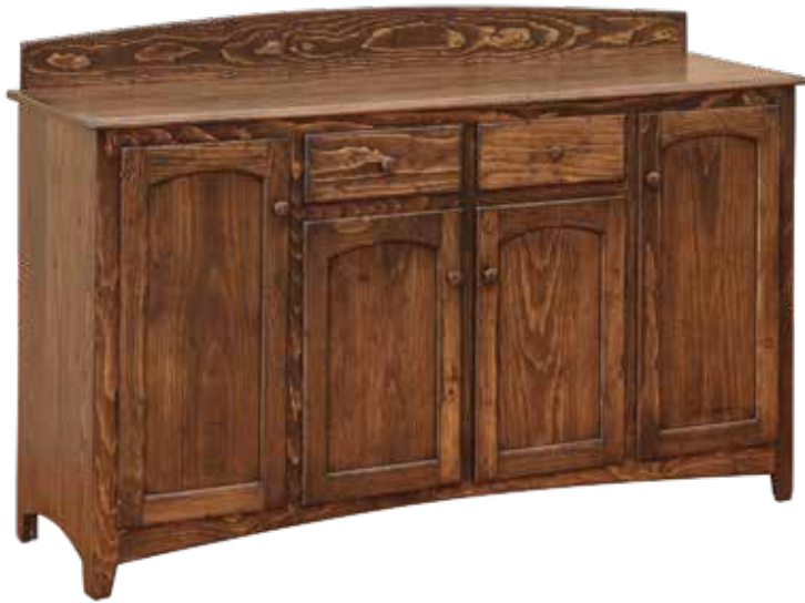
6637 Sideboard 66"w x 19"d x 42"h One Fixed Shelf Behind Doors Shown in Heavy Distress Special Walnut with Glaze Wormy Maple Top