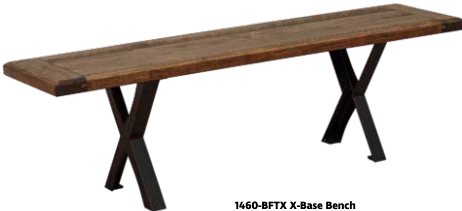
1460-BFTX X-Base Bench 1¾" Wormy Barn Floor Plank Top

Shown in Light Distress Special Walnut with Black Base