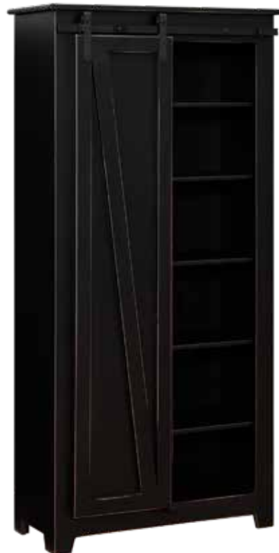
3572BD Large Coffee Station 35" w x 15" d x 72" h Shown in Black with Rub