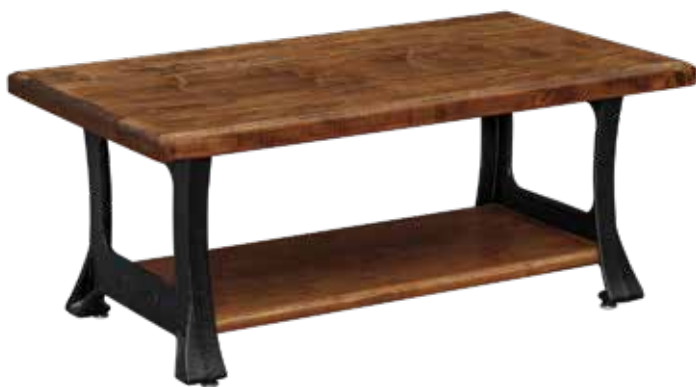
4224 Coffee Table with Cast Iron Base Wormy Maple Top & Shelf 42"w x 24"d x 18"h Shown in Heavy Distress Special Walnut Top & Shelf