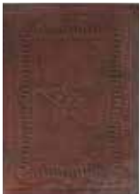
Federal in Rustic Tin