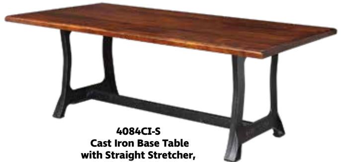
4084CI-S Cast Iron Base Table with Straight Stretcher, Wormy Maple Top 84"w x 40"d x 30"h Shown in Heavy Distress Michael's Cherry Top