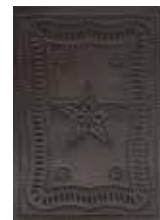
Federal in Blackened Tin