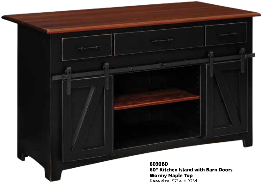
6030BD 60" Kitchen Island with Barn Doors Wormy Maple Top Base size: 57"w x 23"d Top size: 60"w x 30"d Shown in Light Distress Michael's Cherry Top, Black with Rub Base