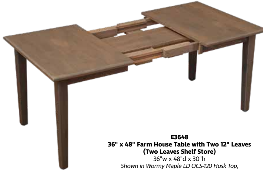
E3648 36" x 48" Farm House Table with Two 12" Leaves (Two Leaves Shelf Store) 36"w x 48"d x 30"h Shown in Wormy Maple LD OCS-120 Husk Top, Pine Base LD OCS 121 Smoke