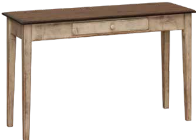
T99 Shaker Sofa Table 48" w x 16" d x 30" h Wormy Maple Top HD Special Walnut Top HDLC Beige Bottom