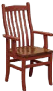
341 Lincoln 22.5"w x 16.5"d x 39.75" h