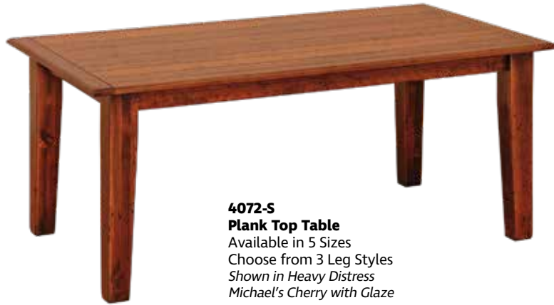
4072-S Plank Top Table Available in 5 Sizes Choose from 3 Leg Styles Shown in Heavy Distress Michael's Cherry with Glaze