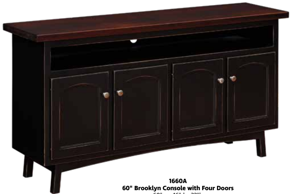
1660A 60" Brooklyn Console with Four Doors 60"w x 16"d x 32"h Shown in Rustic Brown Maple, Sawmill Plank Top OCS-117 Asbury, Black with Rub, Pine Base Available with Flush-Cut Top 1656A