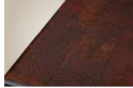
2222 Brooklyn End Table 22"w x 22"d x 25"h Shown in Rustic Brown Maple, Sawmill Plank Top, OCS-117 Asbury Top, OCS 348 Chelsea Gray Base