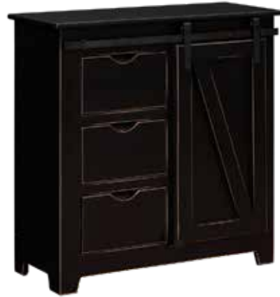
3536 BD Small Coffee Station 35" w x 15" d x 36" h Shown in Black with Rub