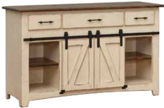
6036 ABD Barn Door Hutch Base with Three Drawers 60"w x 21"d x 36"h Shown in Heavy Distress Special Walnut Top Base: Heavy Distress Sandstone with Rub