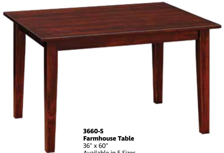
3660-S Farmhouse Table 36" x 60" Available in 5 Sizes Choose from 3 Leg Styles Shown in Rich Cherry

Tables under 40"w come standard with 2.75" legs Tables over 40"w come standard with 4" legs