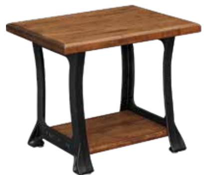
2722 End Table with Cast Iron Base Wormy Maple Top & Shelf 27"w x 22"d x 24"h Shown in Heavy Distress Special Walnut Top & Shelf