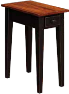
T98D Shaker Chair Side with Drawer 12" w x 20" d x 25" h Wormy Maple Top Michael's Cherry Top Black with Rub Base