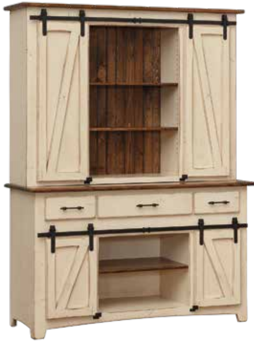
6036 BD Barn Door Hutch with Three Drawers 60"w x 21"d x 80"h Shown in Heavy Distress Special Walnut Tops & Back Base: Heavy Distress Sandstone with Rub