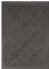
Old Mill in Blackened Tin