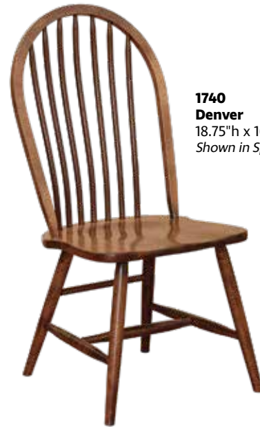
1740 Denver 18.75"h x 16.25"d x 39"h Shown in Special Walnut