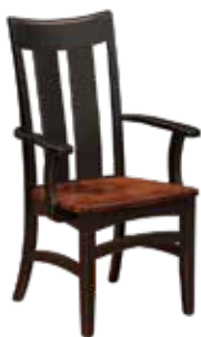
2121 Galveston 24" w x 17" d x 40.25" h