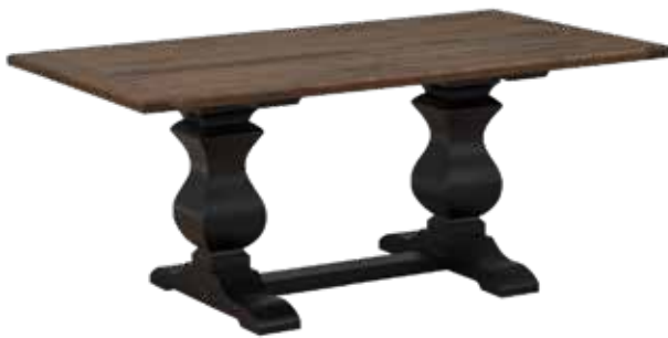
4072T-BFT-RC Trestle Table 40"w x 72"d x 30½"h Sawmill Plank Top Shown in Rustic Cherry Top, Light Distress Special Walnut Stain Base: Pine, True Black Available Without Bread Boards