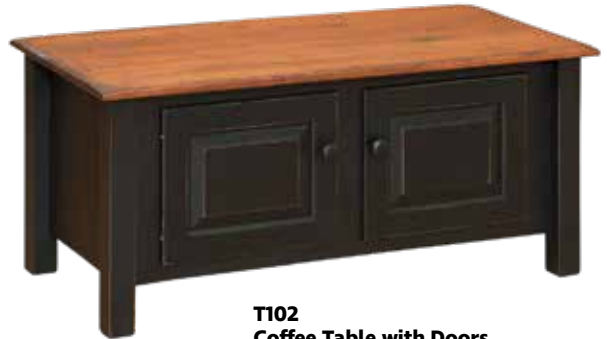
T102 Coffee Table with Doors 41" w x 20" d x 18.5" h Wormy Maple Top HD Harvest Top Black with Rub Base