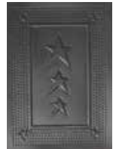
Embossed Star in Country Tin