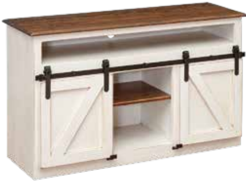
5030BD2 50" Barn Door TV Console with Sound Bar Opening 50"w x 16"d x 30"h Shown in Medium Distress, Special Walnut Top, Coco White with Rub Base