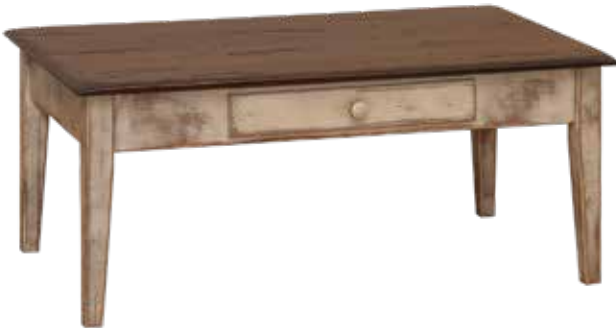
T100 Shaker Coffee Table 42" w x 24" d x 18" h Wormy Maple Top HD Special Walnut Top HDLC Beige Bottom