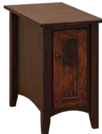
T108 Chairside Table With Door 15" w x 26" d x 25" h Wormy Maple Top Rich Tobacco