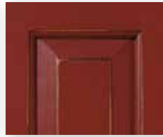
#18 Cottage Red