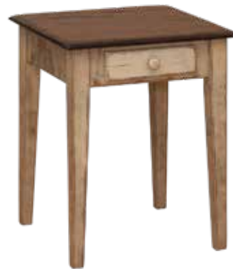
T101 Shaker End Table 20" w x 20" d x 25" h Wormy Maple Top HD Special Walnut Top HDLC Beige Bottom