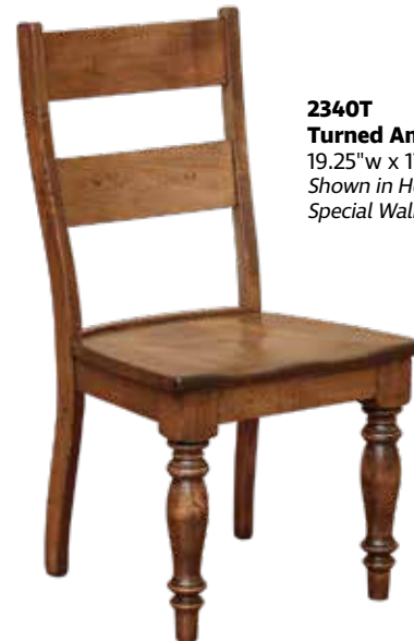
2340T Turned Amhurst 19.25" w x 17.25" d x 38" h Shown in Heavy Distress Special Walnut