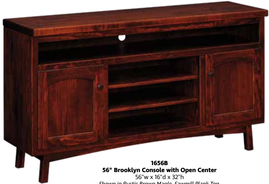
1656B 56" Brooklyn Console with Open Center 56"w x 16"d x 32"h Shown in Rustic Brown Maple, Sawmill Plank Top, LD Michael's Cherry, LD Michael's Cherry Pine Base Available with Overhang Top 1660B