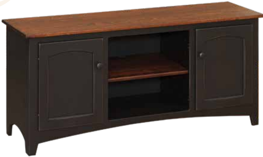
C58 53" TV Console 53"w x 16"d x 24.75"h Two Doors Two Tone — Michael's Cherry Top Black with Rub Base