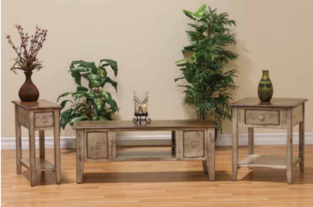
Wood on wood drawer glide