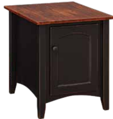
T107 End Table with Door 21" w x 26" d x 25" h Wormy Maple Top Michael's Cherry Top Black with Rub Base