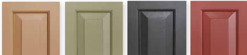
305 True Brown