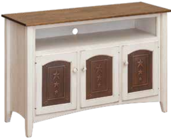
C54T 50" TV Cabinet (A) with Tin 50"w x 17"d x 32.5"h Special Walnut Top Coco White with Rub Base

Also Available with Flat Panel Doors C54W