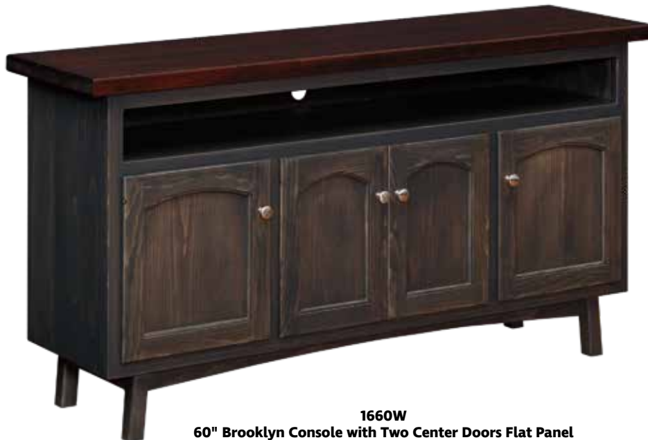
1660W 60" Brooklyn Console with Two Center Doors Flat Panel 60"w x 16"d x 32"h Shown in Rustic Brown Maple, Sawmill Plank Top, OCS-117 Asbury Top, OCS-118 Antique Slate Pine Base Also Available with Flush-Cut Top 1656W