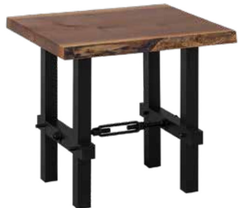
2724LE End Table Post & Beam 27"w x 24"d x 25"h Rustic Walnut Top, Poplar Base Shown in Clear Coat Top Base True Black