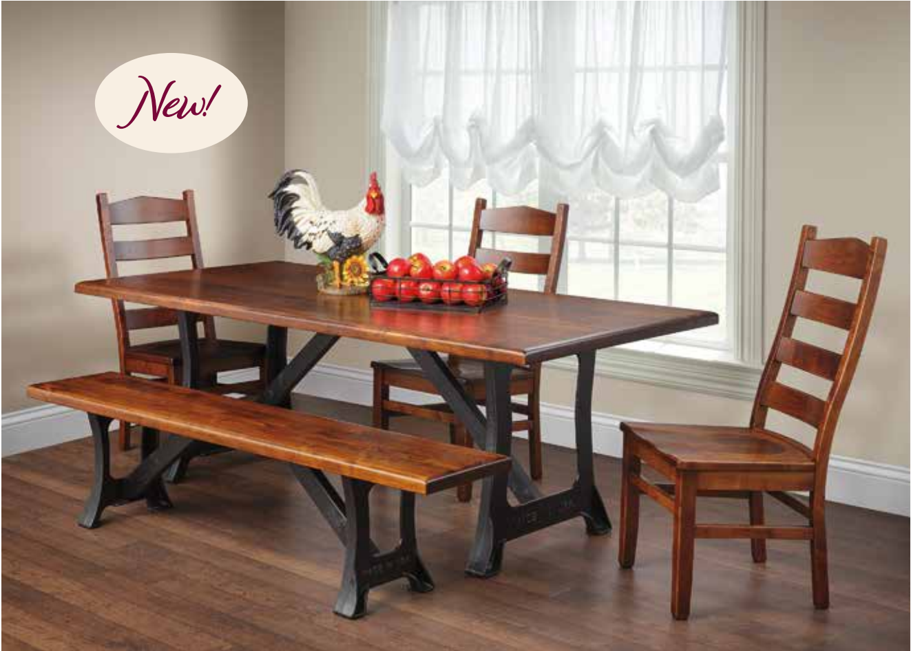
Cast Iron Base Table & Bench